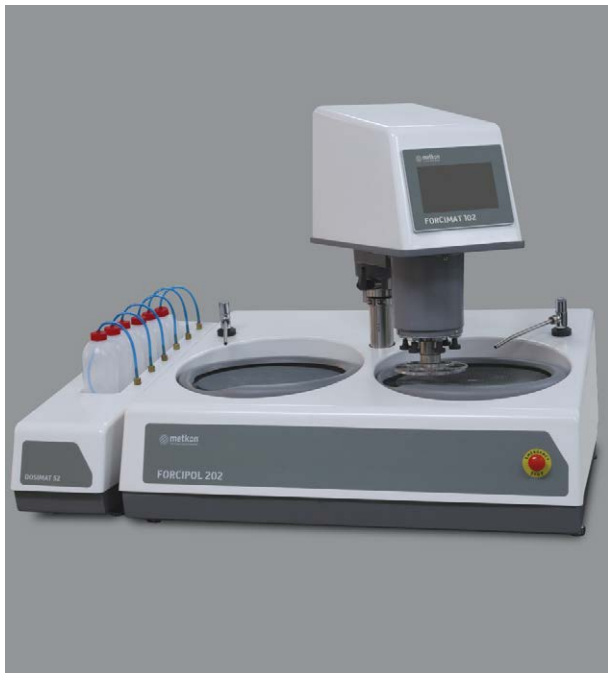
FORCIPOL 202 with FORCIMAT 102 & DOSIMAT 12

Optional encoder allows you to measure the amount of material removed from the surface. The desired grinding depth can be set to grind different type of samples and also for applications that need special accuracy.