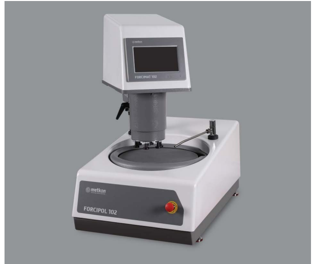
FORCIPOL 102 with FORCIMAT 102

The "soft start and stop" feature automatically starts the sequence with a low initial force which is then increased to the preset. Towards the end of the cycle, the force is automatically reduced to 75 % of the setting to prevent scratching. A variety of sample holders for individual or central force applications are available for different sample sizes. Both individual and central force specimen holders can be removed and inserted easily with the help of quick release chuck. By holding the head button on the software, the specimen holder will rotate for easy insertion and removal of the specimens.