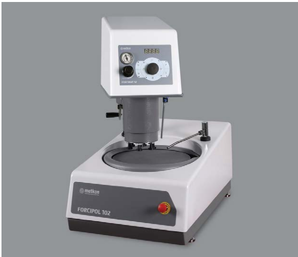
FORCIPOL 102 with Forcimat 52

When needed, FORCIMAT 52 can work in manual mode to allow prepare specimens by hand.