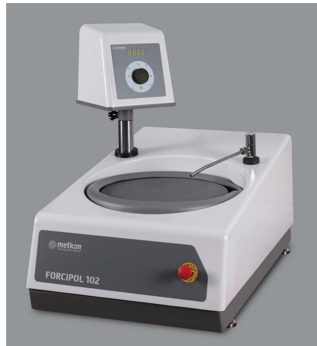
FORCIPOL 102 with Control Unit

Enviro Filter Unit is a closed loop recirculating filter system which is optionally available. It has a 20 lts. reservoir capacity with 1 micron