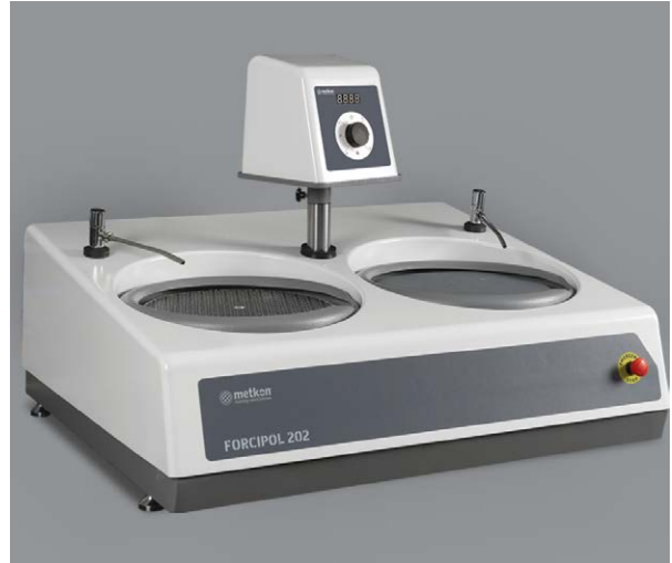
FORCIPOL 202 with Control Unit

Automatic Disc Cleaning & Drying function can be activated with a single button to obtain perfectly cleaned disc surfaces in seconds. Smart Water Saving feature allows tons of water saving over the years.