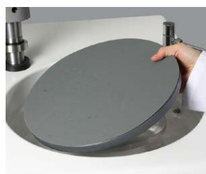
Simple exchange of working discs