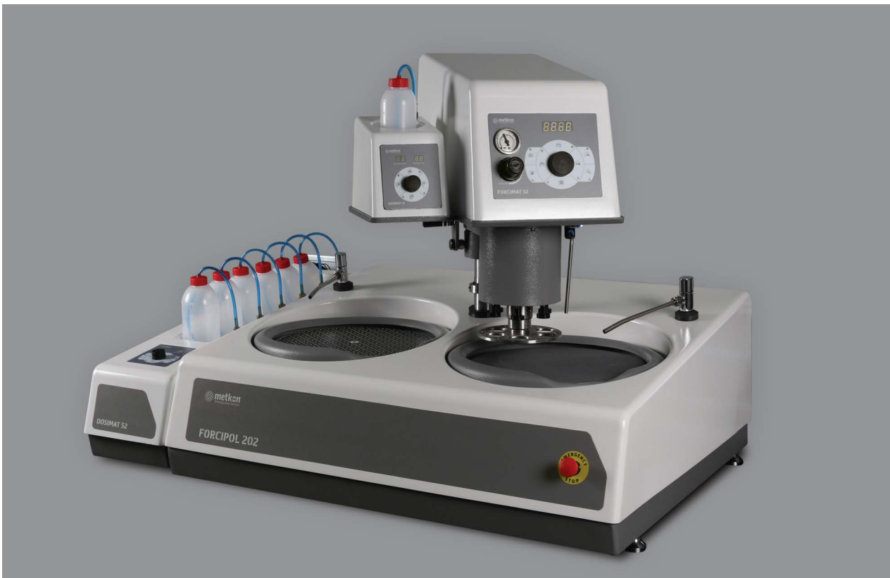
FORCIPOL 202 + FORCIMAT 52 + DOSIMAT 12 + DOSIMAT 52

Dispensing parameters like; frequency, dosing time, fluid selection etc. are controlled through the LCD screen of the FORCIMAT 102 Automatic Head and can be stored in memory.