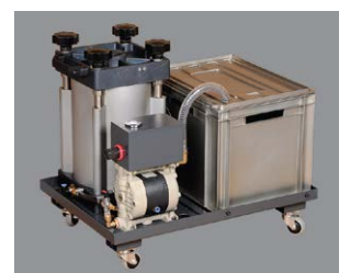
Enviro recirculating filtering unit (1 micron)