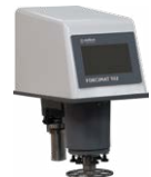
FORCIPOL CONTROL UNIT