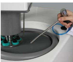
Retractable water hose for easy cleaning

filter entering the grinder / polisher intake. Enviro can also be coupled with line water and 80 micron filtering system for disposal.