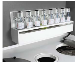
Automatic Fluid Dispenser