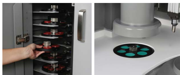
Automatic Sample Holder Feeding Unit