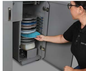
Grinding/Polishing Disc Storage for Automatic Disc Replacement

VELOX 102 is equipped with automatic peristaltic dosing system with 8 peristaltic pumps [ 6 for diamond suspensions/lubricant and 2 for aluminum oxide suspensions]. The automatic peristaltic dosing system is used in combination to obtain consistent specimens and to save time and consumables. Both diamond suspensions/lubricants and aluminum oxide suspensions can be fed. Dispensing parameters like; frequency, fluid selection etc. are controlled through the LCD screen of the VELOX 102. High quality peristaltic pumps guarantee exactly the same dosing every time. Pre-dosing function lubricates the polishing cloth before each operation to increase the life of polishing cloth and obtain perfectly polished specimen surfaces. The suspensions and lubricants that are remained in the dosing tubes retract back at the end of every step to eliminate the risk of contamination from coarse abrasive on a finer grain size with auto retract function. Automatic Liquid Level Calculation of suspensions and lubricants is also available and can be monitored through the LCD screen of the VELOX 102. The calibration can be carried out when a lubricant or suspension is filled. The operator will be informed to refill the bottle when the suspension/lubricant level is below the critical value. All bottles have a magnetic stirrer inside to prevent sedimentation of suspensions and make more homogenous abrasive distribution inside the suspension.