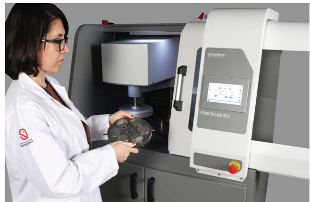
Ergonomic operation resulting in high quality planar surface, thus saving time on the next preparation steps

A recirculating cooling unit is strongly recommended so that a rust inhibitor can be added and the grinding swarf can be collected. The entire working area is totally enclosed. Sliding door provides easy access in the grinding area. Electronic brake is integrated to the system for a rapid stop of the grinding stone. The interlocking safety device does not allow the door to be opened before the grinding motor is stopped.