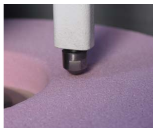
Automatic dressing of the grinding stone