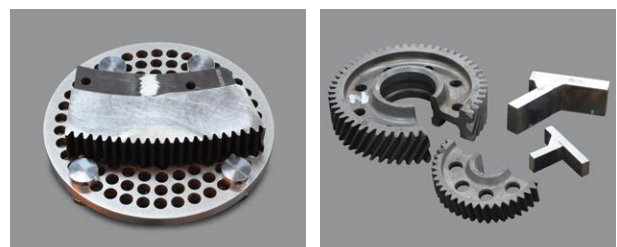
Ability to grind mounted specimens with specimen holders as well as irregular shaped unmounted samples.

The FORCIPLAN 352 uses the same central force specimen holders with FORCIMAT 102 Automatic Head and ACCURA 102, therefore the additional grinding and/or polishing steps can be carried out without transferring to a new specimen holder.