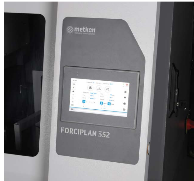
Programmable HMI touch screen controls

Optional Barcode Scanner allows easy and quickly loading of correct parameters for different samples. This will eliminate the risk of loading wrong programs due to operator error and increases efficiency. You can simply develop a barcode system for your each specimen on your laboratory to enable fast data entry with less errors.