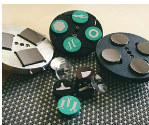
Integration with Forcimat 102 and Accura 102