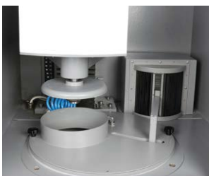
FORCIPLAN 352, Grinding chamber