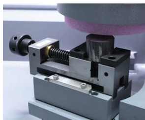
Mechanical Clamping Device