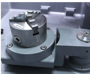
Mechanical 3-jaw Chuck