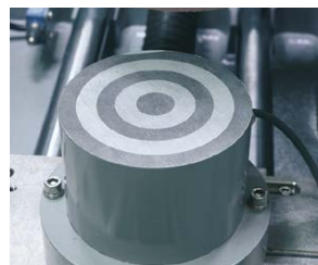
Electromagnetic Clamping Device