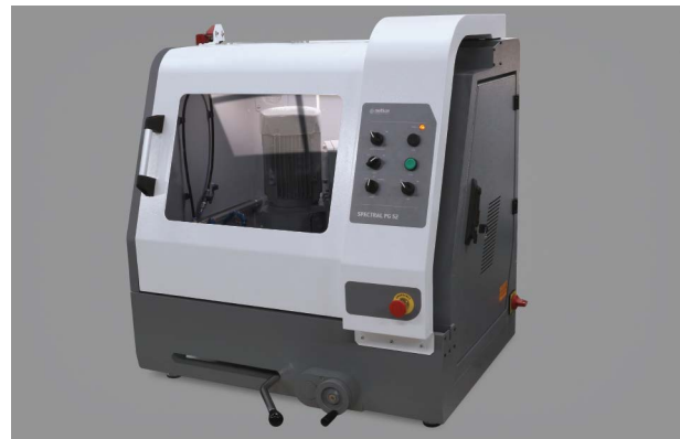
SPECTRAL PG 52 Grinding Machine

Spectral PG 52 is equipped with braking device permitting a rapid stop of the grinding wheel. The machine is fitted with an interlocking safety device not allowing the hood being opened before the grinding motor is stopped.